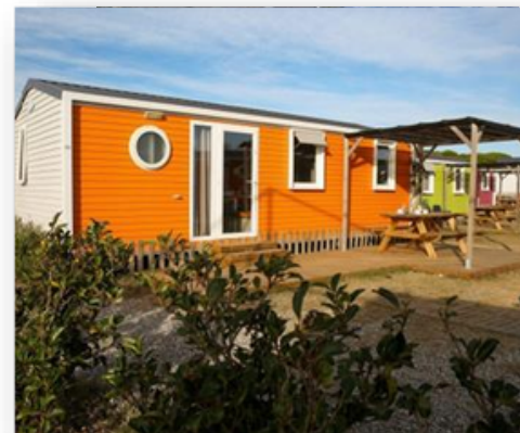
Mobile home 3 room 6 pax.