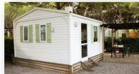
Mobile home 1 room 2 pax