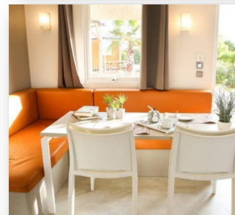
Mobile home large living room